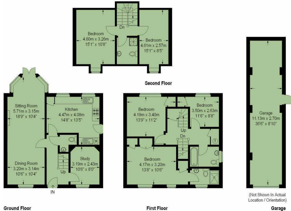
Illustration for identification purposes only, measurements are approximate, not to scale.

FOR MORE INFO AND TO SEE OUR OTHER LOVELY PROPERTIES CHECK OUT OUR WEBSITE