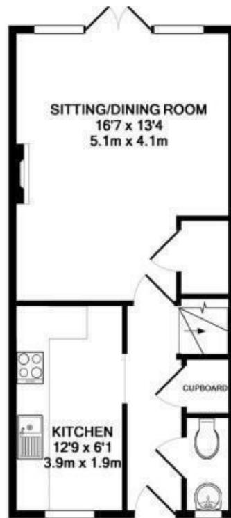
GROUND FLOOR APPROX. FLOOR AREA 548 SQ.FT. (50.9 SQ.M.)