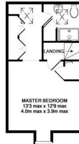
2ND FLOOR APPROX. FLOOR AREA 315 SQ.FT. (29.3 SQ.M.)

TOTAL APPROX. FLOOR AREA 1255 SQ.FT. (116.6 SQ.M.)