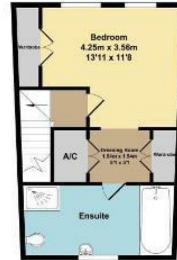
2nd Floor Approx. Floor Area 34.33 Sq.M. (370 Sq.Ft.)

FOR MORE INFO AND TO SEE OUR OTHER LOVELY PROPERTIES CHECK OUT OUR WEBSITE